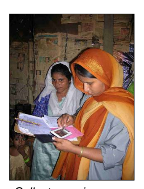
Collectors using palm pilots

portfolio. In 3 years, the first 'palm' branch has accumulated a loan portfolio (CHF 66'924) close to the loan portfolio of the youngest 'manual' branch (CHF 85'959) that has been running for 5 years.