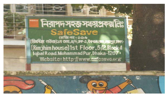
SafeSave's Head office in Dhaka in 2005

The author conducted the research over three months in Dhaka, Bangladesh, in late 2005. The results of the study are based on a comparison of income statements between branches with and without palm pilots and on interviews with staff and clients. Finally, conclusions are also drawn on the applicability of this technology for Microfinance Institutions (MFIs) working in rural areas.<sup>2</sup>